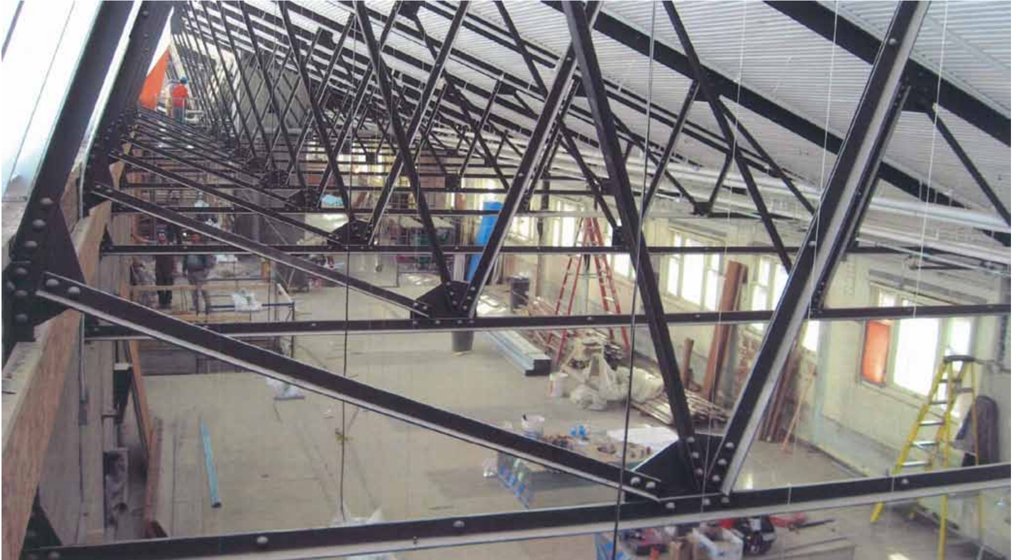
Triffo Hall, University of Alberta Edmonton, Alberta