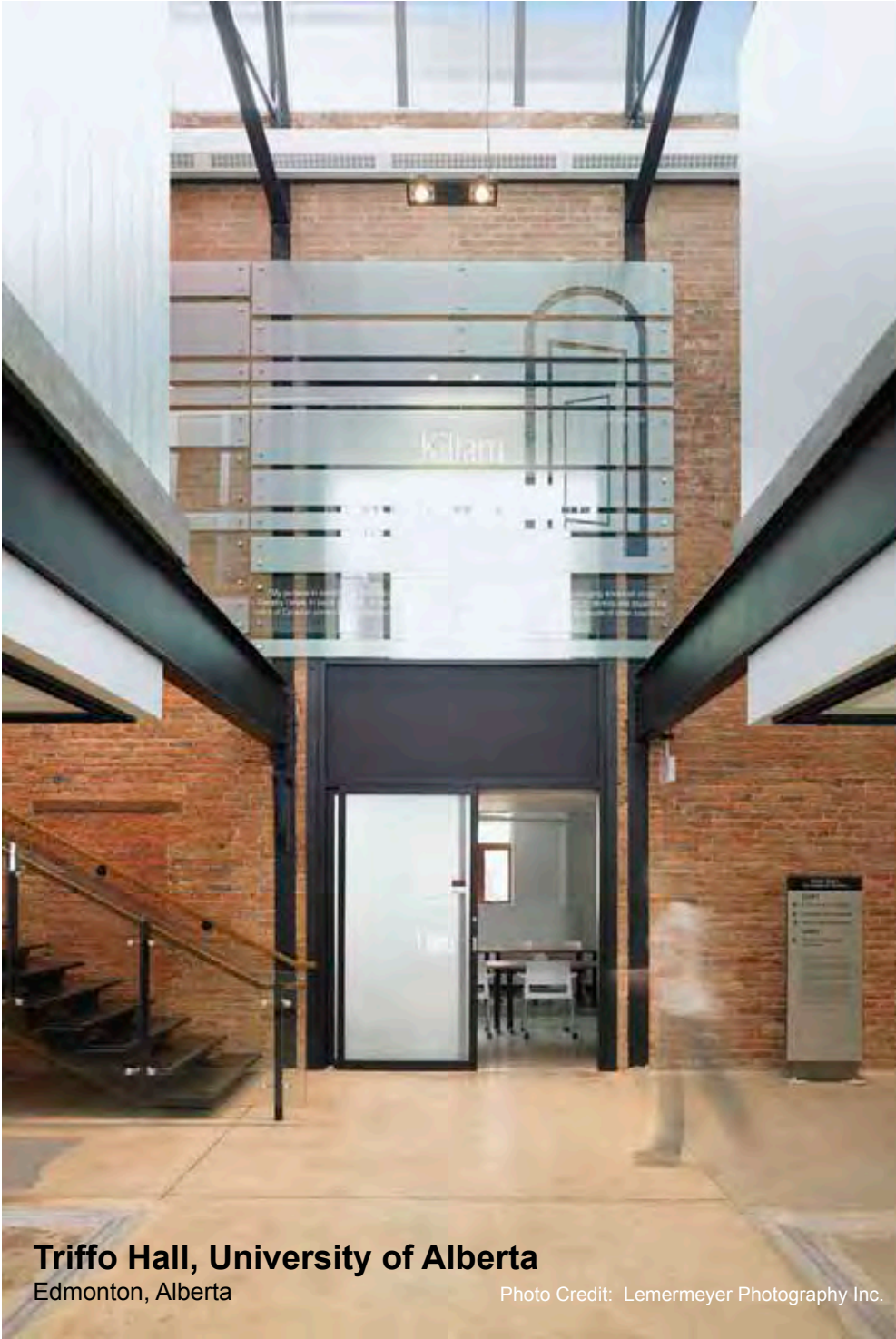
Triffo Hall, University of Alberta