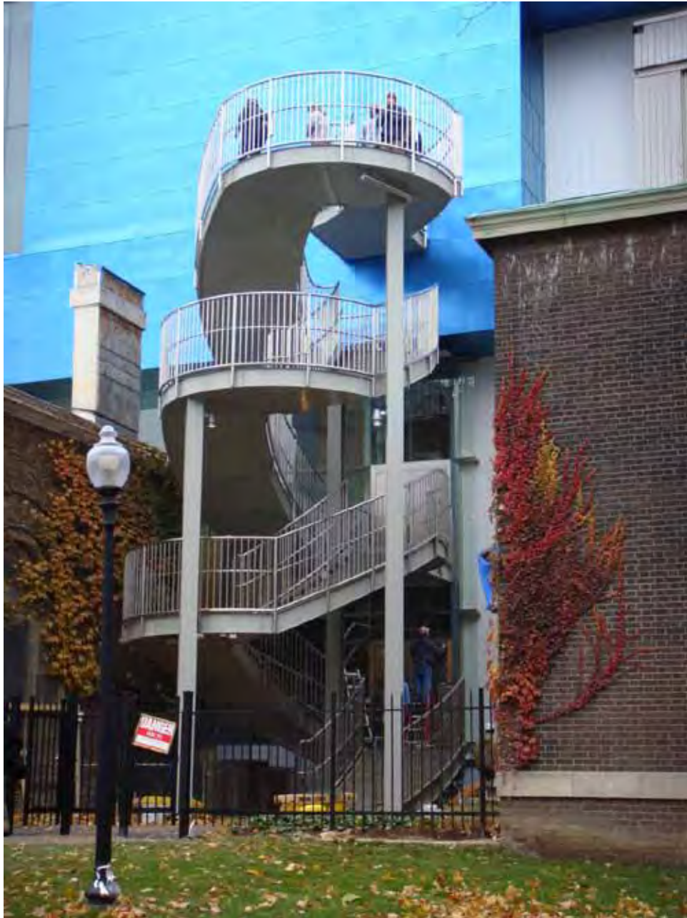
Art Gallery of Ontario Transformation Toronto, Ontario