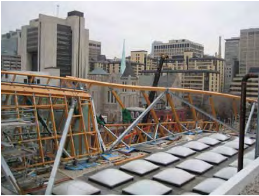
Art Gallery of Ontario Transformation Toronto, Ontario