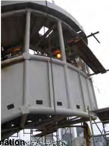
Art Gallery of Ontario Transformation Toronto, Ontario